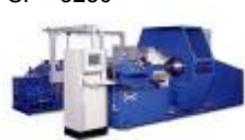
SP - 7230