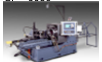
SPT - 1675