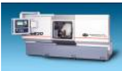
SP - 3230