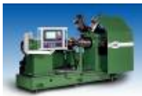
SP - 6030